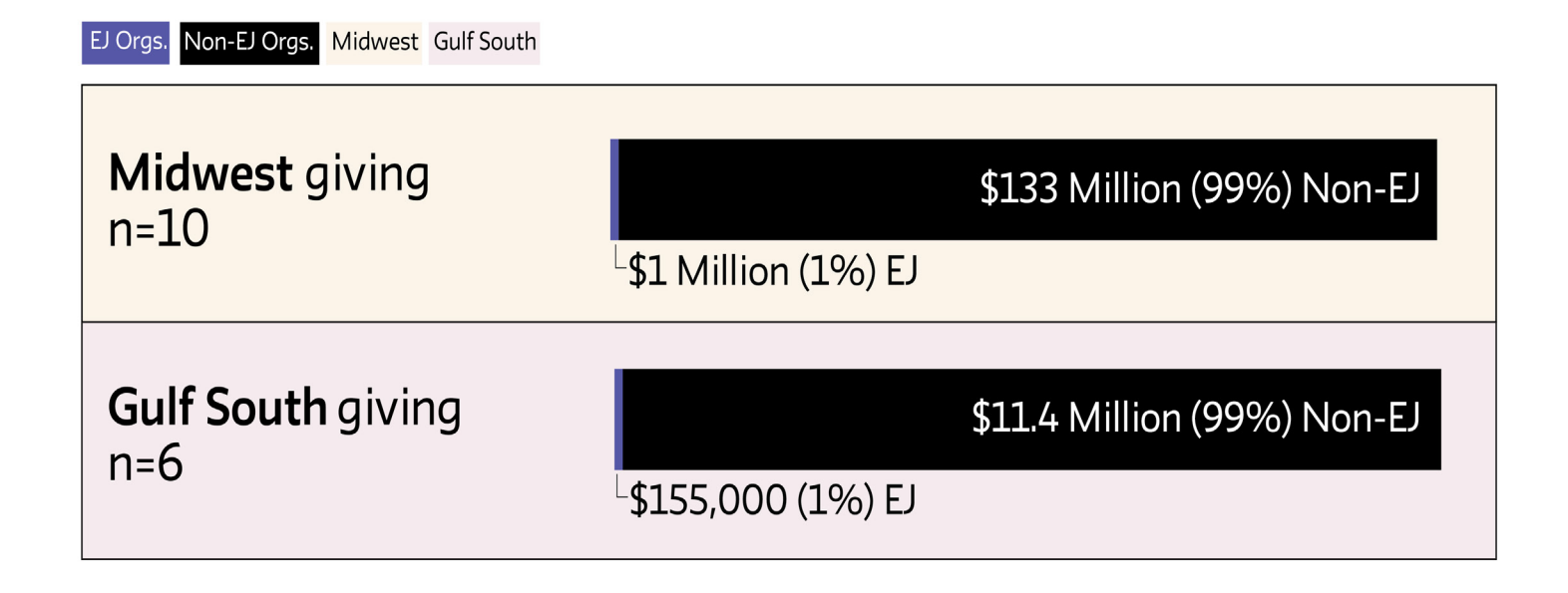
Figure 3: EJ vs. Non-EJ Organizations Receiving Grants from Midwest and Gulf South Funders

Data from the Foundation Center was also used to compare the amount of funding that regional funders dispersed to non-EJ organizations vs. EJ organizations. Data was available from the Foundation Center Directory for ten Midwest foundations and six Gulf South foundations, represented in Figure 3. The regional funders follow a similar pattern as national funders, with the majority of their environmental grant funding allocated to non-EJ organizations.<sup>40</sup> It is important to note that some of these regional funders provide grants to organizations in other parts of the country as well.