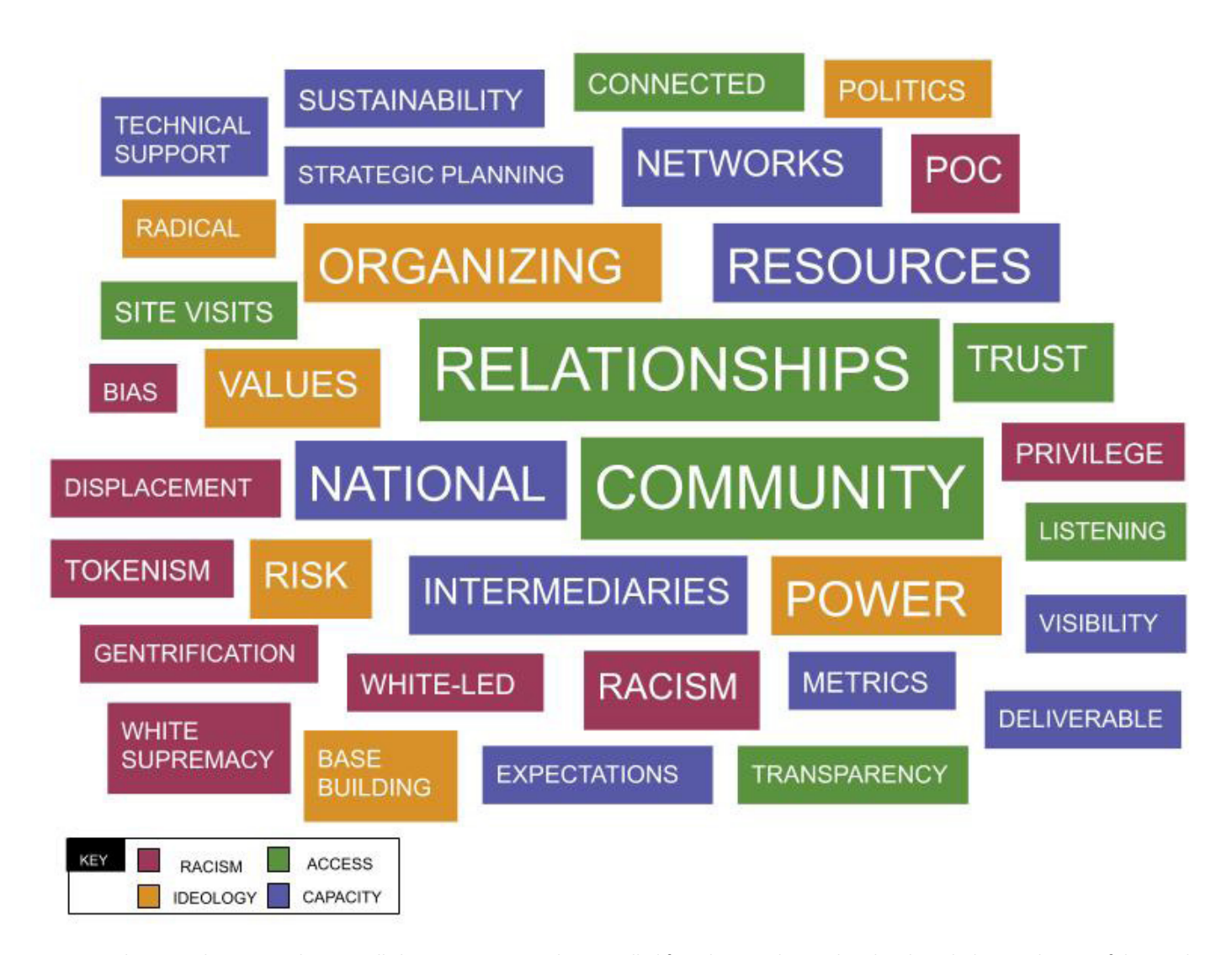
Figure 5: These words were used repeatedly by interviewees and were pulled from key words correlated with each theme. The size of the words corresponds to the frequency the word was used in interviews.